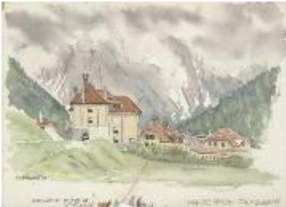
Headquarters of the 10 th Mountain Division, the Po Valley.